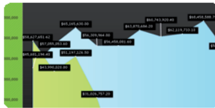
Powerful sales reporting

Using the inbuilt campaign scheduler you can set your email or txt campaigns to send automatically at a time of your choosing.